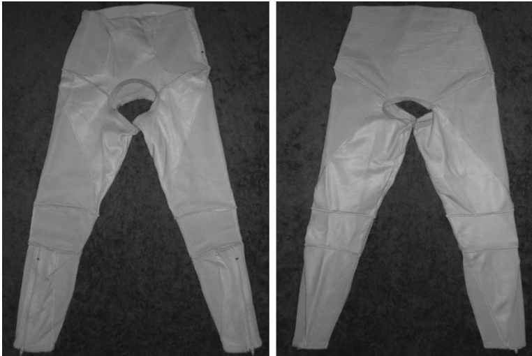
Figure 1. Shows the anterior and posterior view of the dynamic elastomeric fabric orthotic (DEFO) leggings.