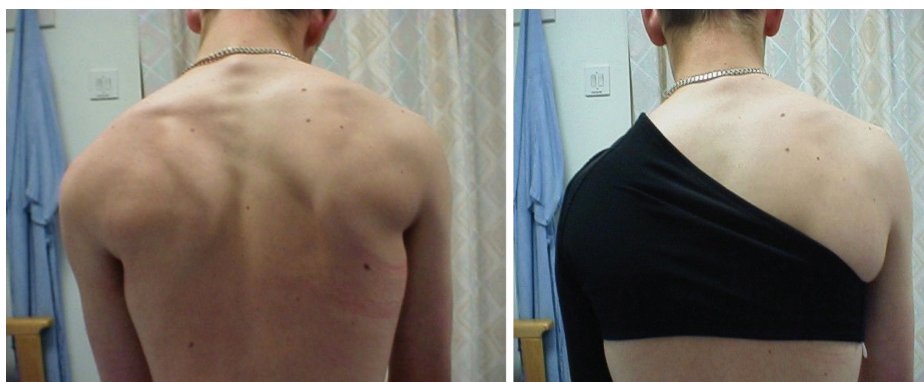
Figure 2. The client before first fit of the shoulder orthosis (left) and with the orthosis (right). Note the flattened scapula.

Radiography was repeated 4 months later (August) when the subject attended for orthopedic review (Figure 1, right). Examination revealed persisting inferior subluxation of the humeral head with no frank dislocation (A frank dislocation, otherwise known as a complete dislocation (luxation), is where the joints of both surfaces have lost contact with each other. When bones that make up the joint remain in partial contact it is called a subluxation or partial separation.), no bony injury, a positive sulcus sign with no ligamentous laxity and full range of passive movement.