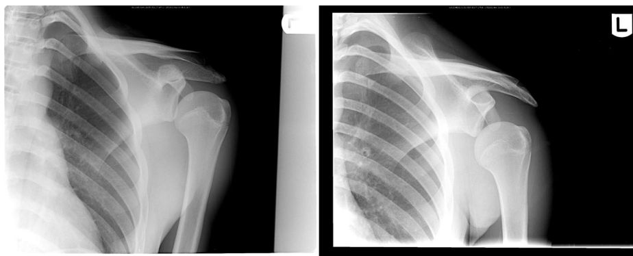
Figure 1. The x-rays at onset (left) and 4 months later (right).